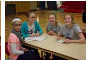
Team members will win medals for placing first, second and third.