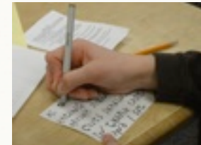
Roman cursive script

Mini-sessions are opportunities to explore more about Roman culture. During this hour, you can choose to chat with a Roman optio, to paint a vase with a mythological theme, learn some Ancient Greek, play Roman board games, learn Roman script and make a scroll, make a Roman cameo, converse in Latin (don't worry, we'll help), make a mosaic, make a model of the Colosseum or a Roman soldier, cook some Roman food (and eat it) or make a Roman theater mask. (The cost for this is included in your registration.)