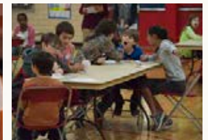
There are three levels for the tests: Intro, Level I and Level II.