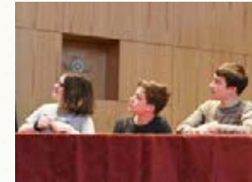
Teams with the most points will advance to the FINAL round in the afternoon.

Oral certamen is a chance for you and your friends to team up and show what you know about grammar, mythology, culture and history. Your team will compete against other teams from the same level. A moderator will ask a question and give your teams a reasonable time to discuss and write down your answer(s). After the allotted time, all teams with the correct answer will earn a point. The preliminary round is held in the morning.