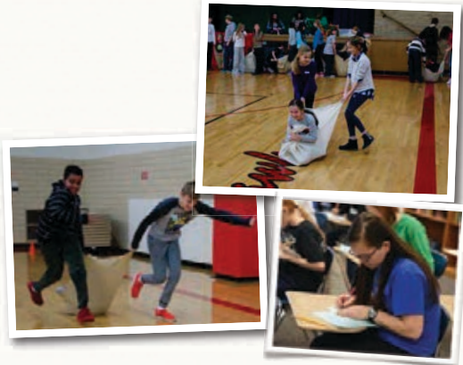
Latin students participating in the Ludi Olympici, Hannibal and the elephants and Ben- Hur events

The Ludi Romani is an event for Latin students to have fun and show what they know about Latin and the Roman culture. There are quiz bowl competitions, individual written tests, mini-sessions and ludi Olympici.